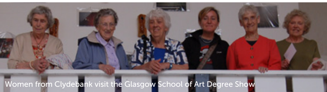
Women from Clydebank visit the Glasgow School of Art Degree Show