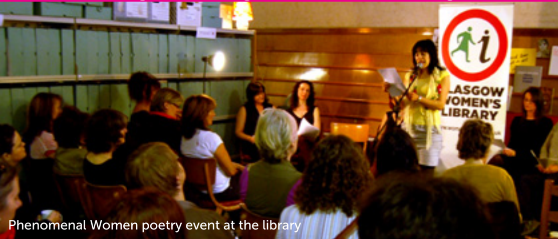
Phenomenal Women poetry event at the library

Reading, sharing and discovering a world of women's writing